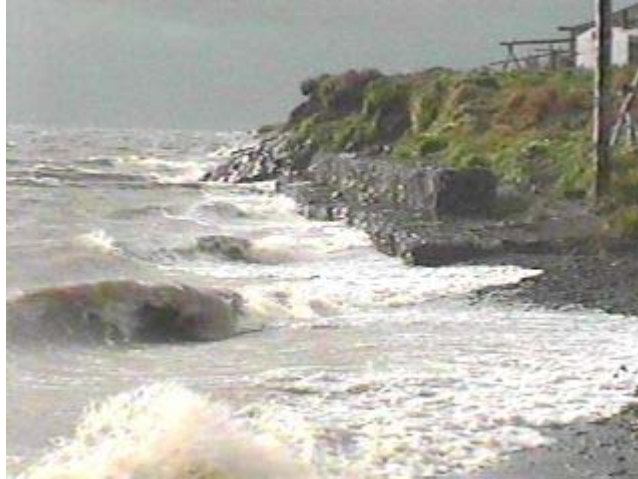
Photo 1: Toksook Bay gabion basket seawall on Kangirrluar Bay; photo courtesy of Greg Lincoln, 1998.