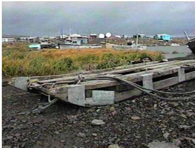
Photo 2: The lagoon area boat moorage; photo courtesy of Greg Lincoln, 1998.